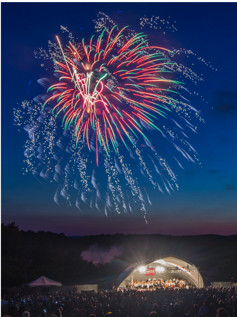
Summer Festival Tour Shelburne Museum

VSO has over 120 volunteers throughout the state who provide everything from free housing for out-of-state musicians to meals between afternoon and evening rehearsals. These volunteers also serve as ushers, ticket takers, parking guards for outdoor concerts, donated food drive coordinators at VSO's Holiday concerts, and orchestra room setup staff. These individuals are integral to the organization's operations.