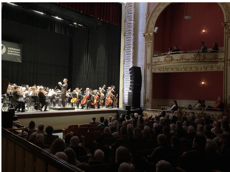
From top left clockwise: The Hollywood Sound at the Paramount Theatre, Rutland; Brass Quintet & Counterpoint at United Church of Newport; Summer Festival Tour at Saskadena Six, South Pomfret; Jukebox Quartet at BETA Technologies, South Burlington; Holiday Pops at the Flynn, Burlington; Holiday Pops at Barre Opera House